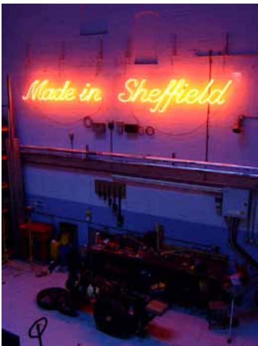
Kelham Island neon sign

Brand new developments house students and professionals, along with small supermarkets, pubs and popular restaurants. The power station building is back in action as well, this time as the Kelham Island Museum, housing a wide range of exhibits on steel production, steam power and wartime Sheffield.